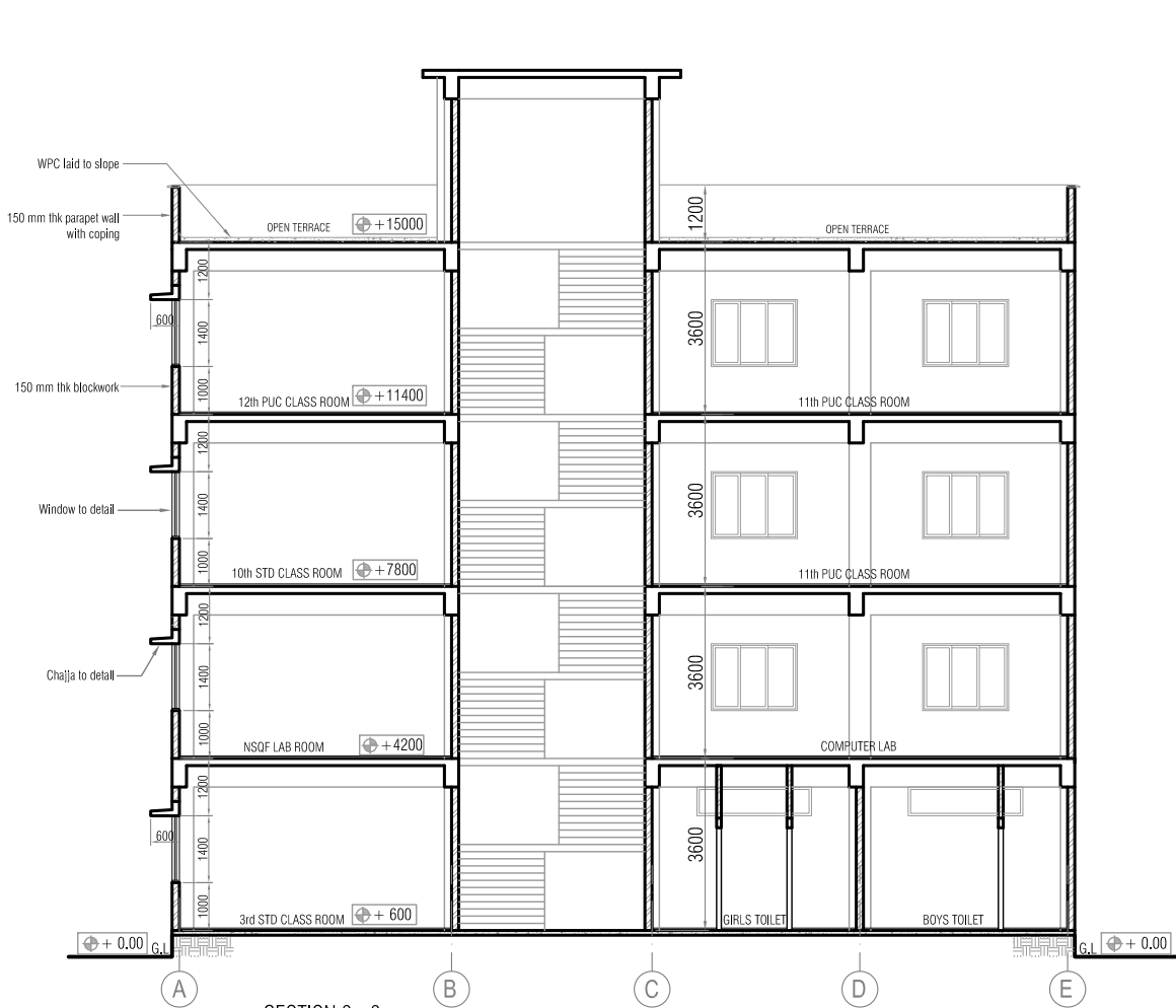
SECTION 3 - 3